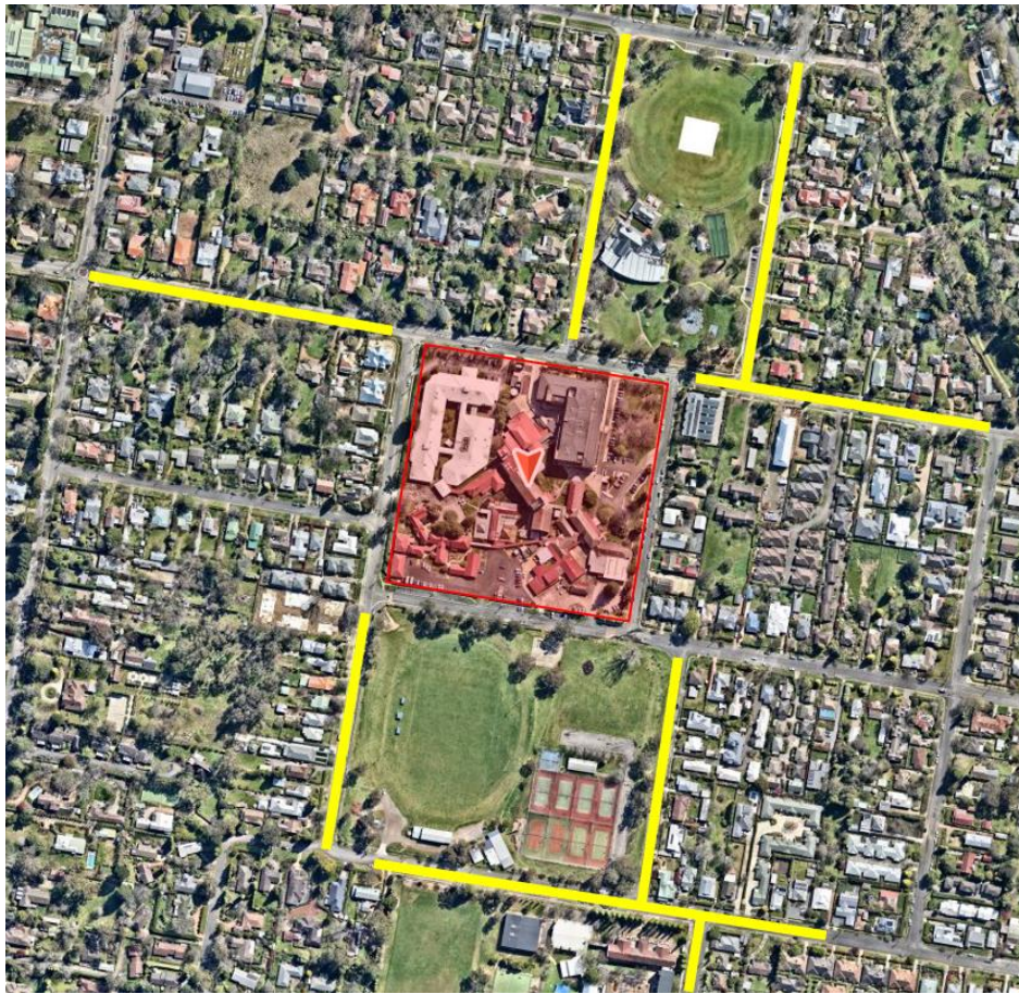
Figure 2: On-Street Parking Areas for Construction Worker Parking

Reference: Bowral and District Hospital – Stage 2 Parking Statement